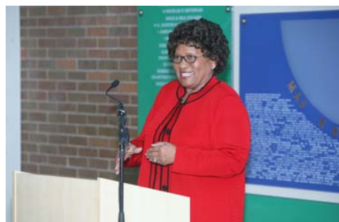
Former U.S. Surgeon General and NCHH Board Member Dr. Joycelyn Elders keynoted the summit.

Dr. Joycelyn Elders commended the “G-40” for coming together for the first time to tackle healthy housing policy challenges. Dr. Elders told participants that “millions of children, elderly, the poor – the most vulnerable among us – live in housing that literally makes them sick. But they can’t do what you have the power to do: join forces not just to propose but implement solutions that can reverberate nationwide.” She also stated that we are at a unique place in our nation’s public health history. Congress and the administration have set high health policy goals. Now’s the time to make healthy housing an equally important public policy priority.